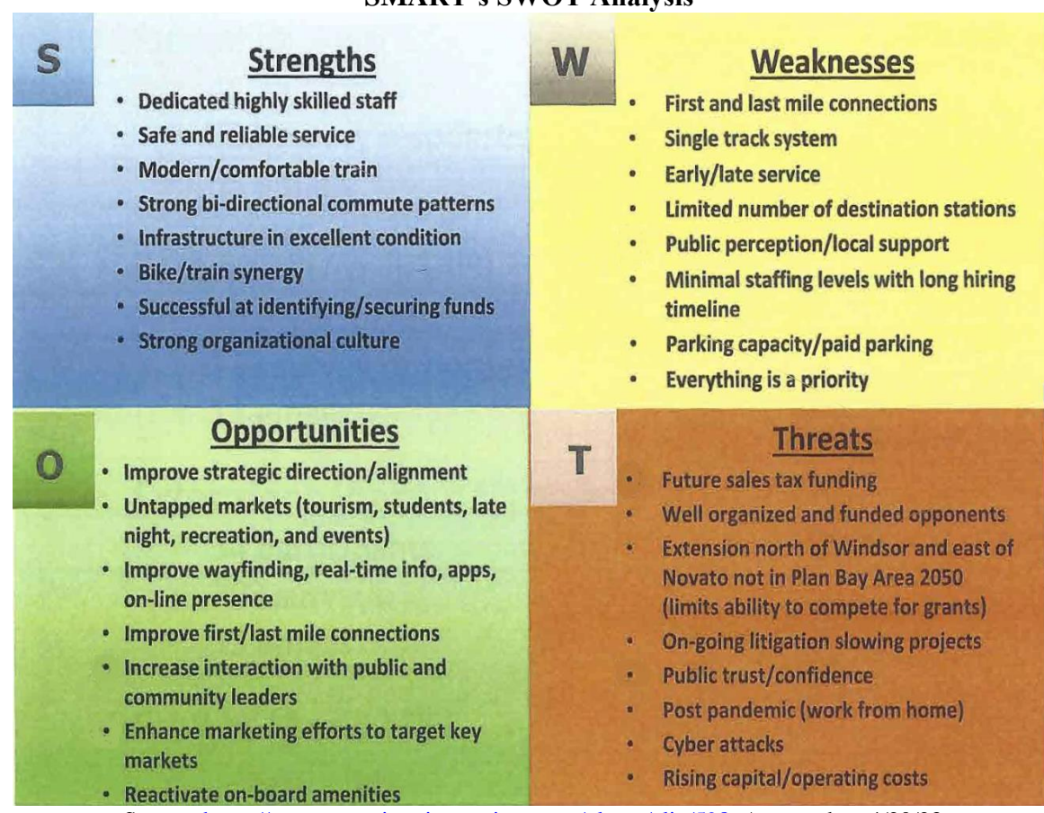
Figure 1 SMART's SWOT Analysis