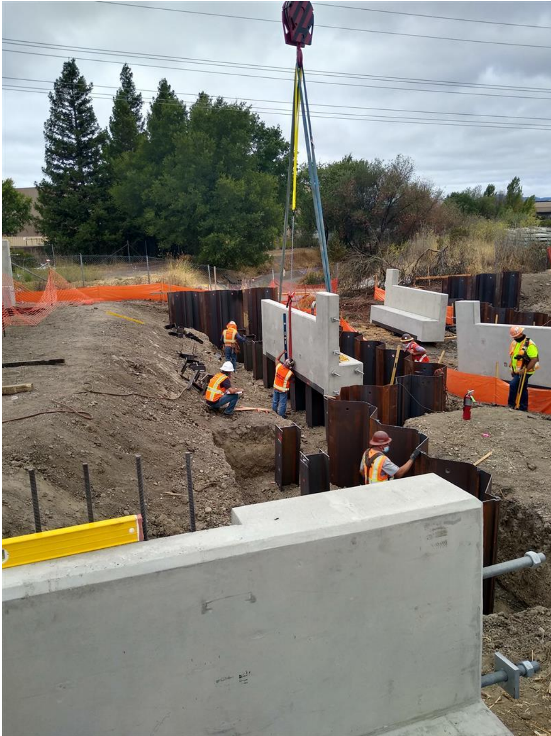
Installing Airport Creek Bridge Abutments