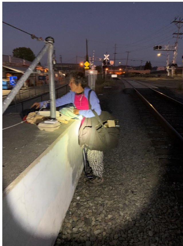
Trespasser at Riverbend and Lakeville, Petaluma