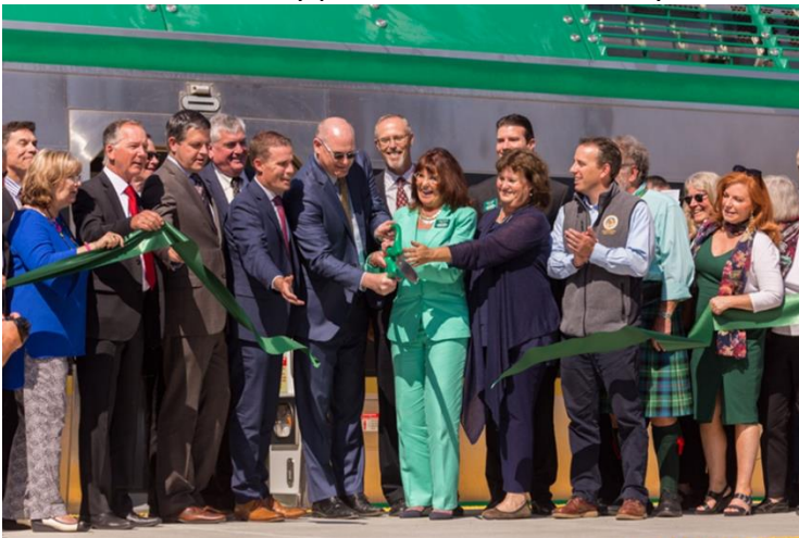
SMART Grand Opening - August 25, 2017

The SMART train is a green commute option for Marin and Sonoma, with connections to San Francisco via the Larkspur Ferry. SMART is continuing to serve our community and creating connections to jobs, education centers, retail hubs and housing along the Sonoma-Marín corridor. We are very proud of the team of dedicated professionals who make up SMART staff and the vital service they provide to the North Bay.