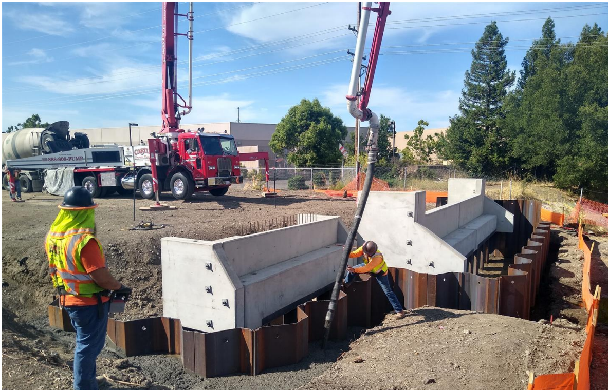
Backfilling Against Bridge Structures at Airport Creek