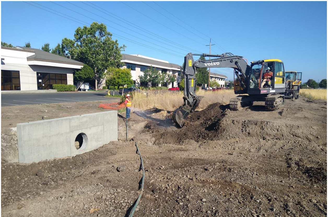
Digging North of Aviation Boulevard to Install New Drainage Pipe