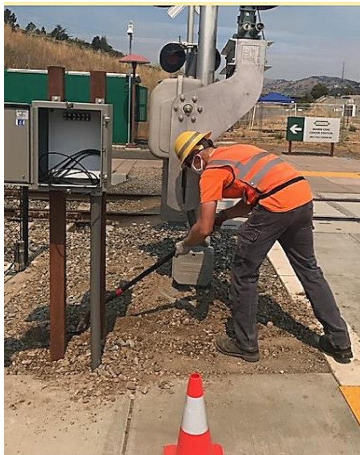
Track Shunt being relocated to an elevated box