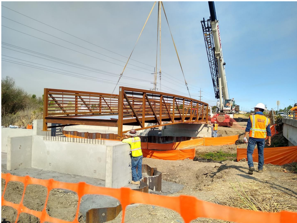
Setting Pedestrian Bridge at Airport Creek