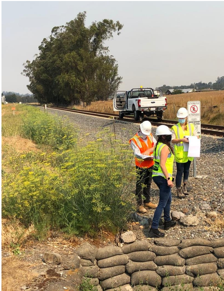
Field Investigation for the Multi-Use Pathway Alignment

GHD Inc. and subcontractors are working on gathering preliminary engineering data for design including environmental, geotechnical, and survey. The Designer, GHD Inc., and their subcontractors finished gathering preliminary engineering data including environmental, geotechnical, and survey. SMART and the design team are evaluating Non-Motorized Pathway alignment options within the SMART right-of-way.