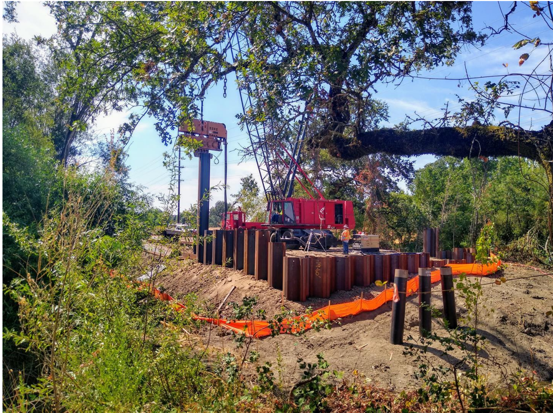
Driving Sheet Piles near Pool Creek