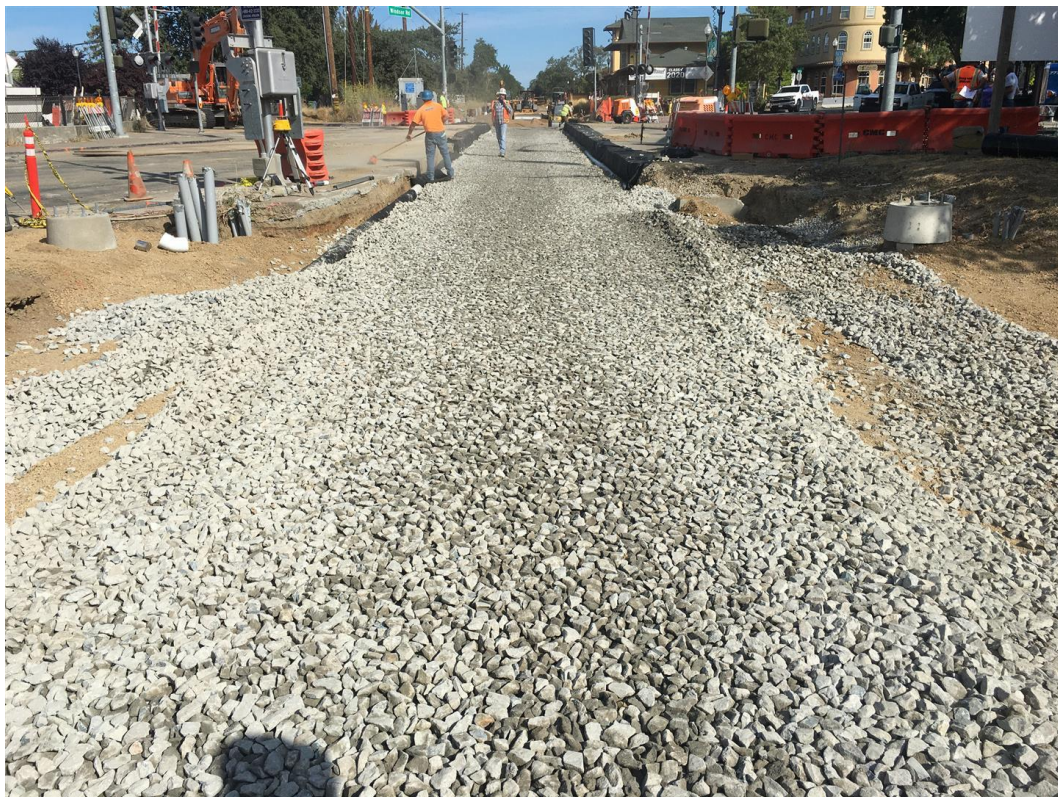
Installing Windsor River Road Railroad Crossing