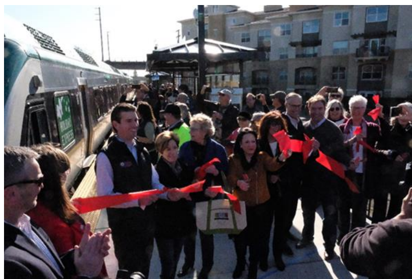
Novato Downtown Station Grand Opening - December 14, 2019