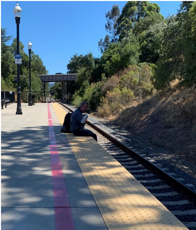
Trespasser sitting at the edge of station platform -Hamilton Station, Novato