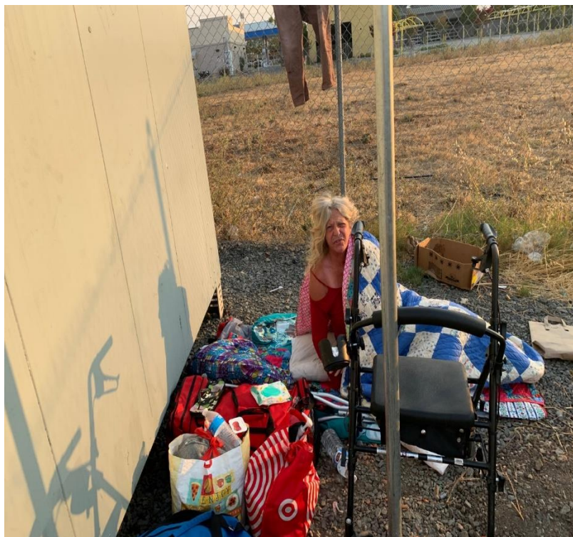
Trespasser camping near the Central Instrument Location (CIL) - Caulfield Lane, Petaluma