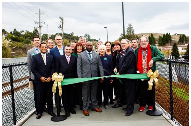
Larkspur Station Grand Opening - December 13, 2019