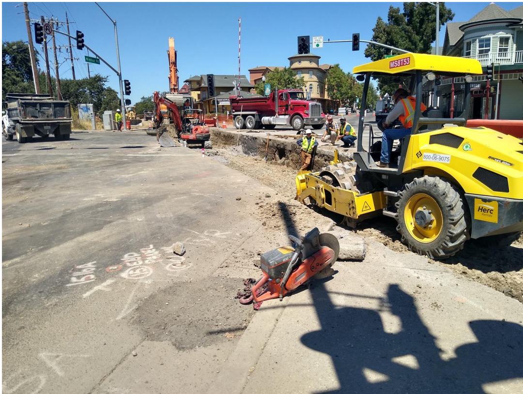
Prepping to Install New Windsor River Road Railroad Crossing