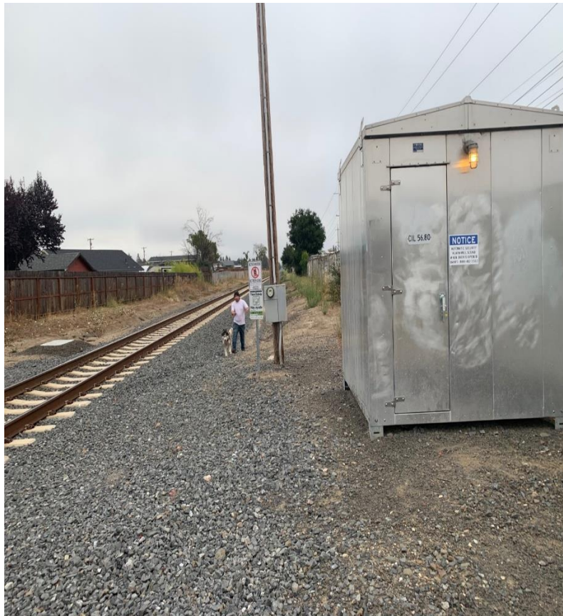
Trespasser at San Miguel, Santa Rosa