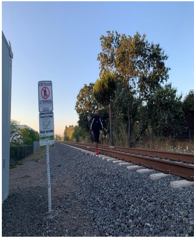
Trespasser at Todd Road, Santa Rosa