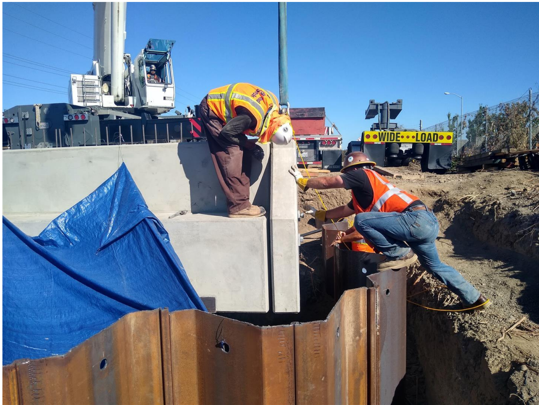
Installing Airport Creek Bridge Abutments