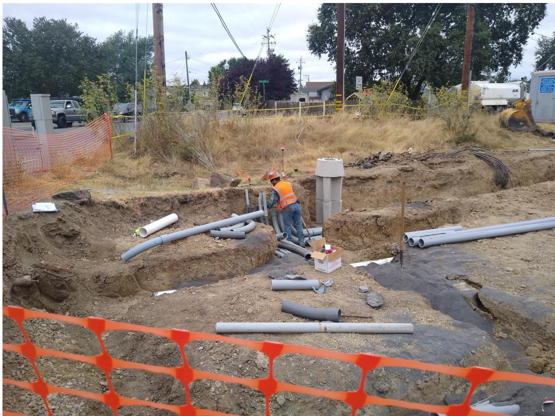
Installing Conduits for Train Control North of Windsor River Road