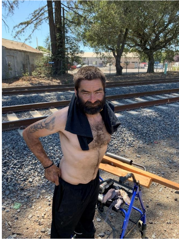
Trespasser at Sebastopol Road, Santa Rosa