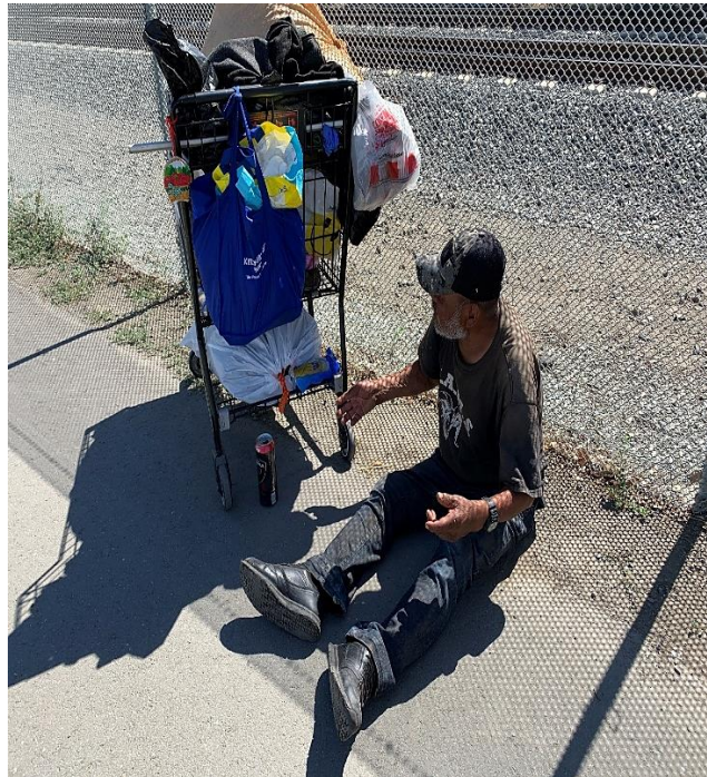
College Avenue Multi-Use Path, Santa Rosa