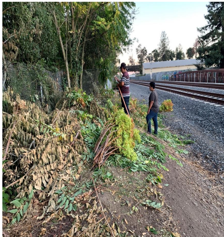
Trespassers cutting vegetation at 3 rd and Sebastopol, Santa Rosa