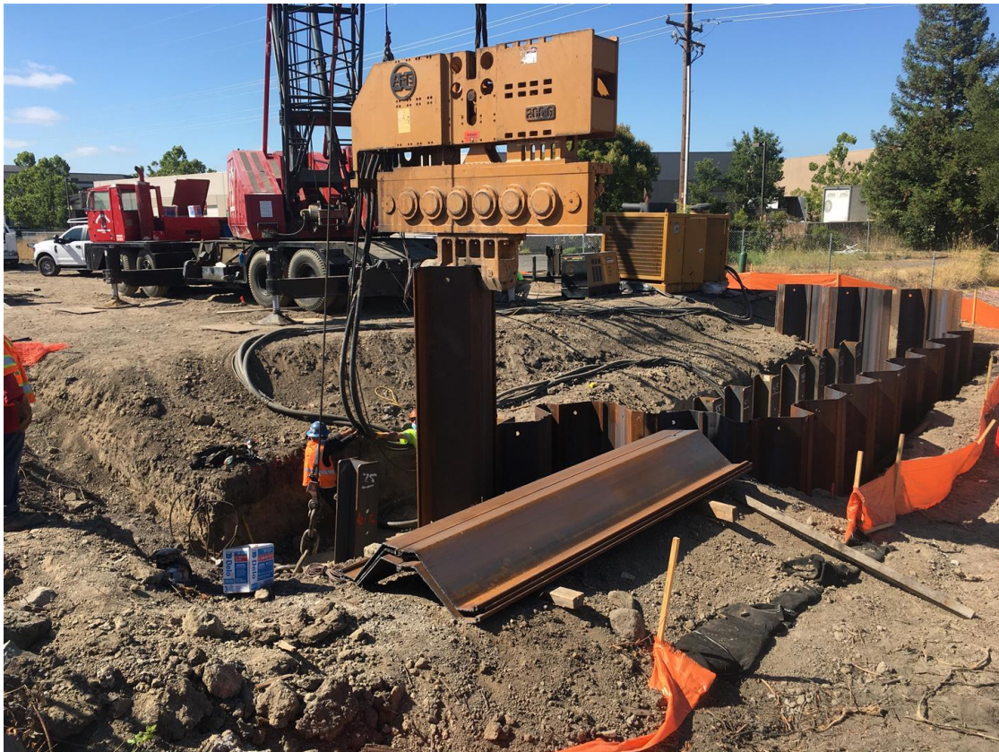
Driving Bridge Sheet Piles at Airport Creek