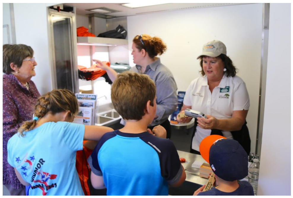
Sharing safety tips with Town of Windsor residents