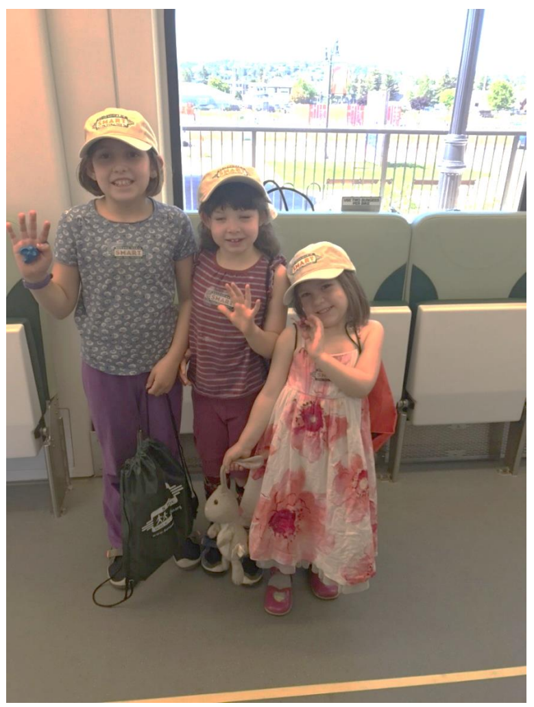
Future train riders check out the SMART train at the Petaluma Butter and Eggs Parade