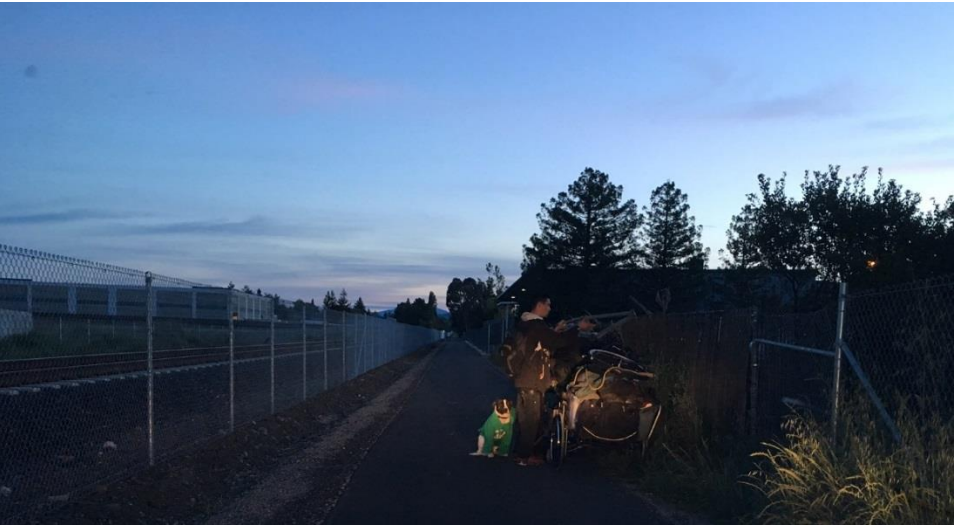
Another trespasser moved along from the pathway.