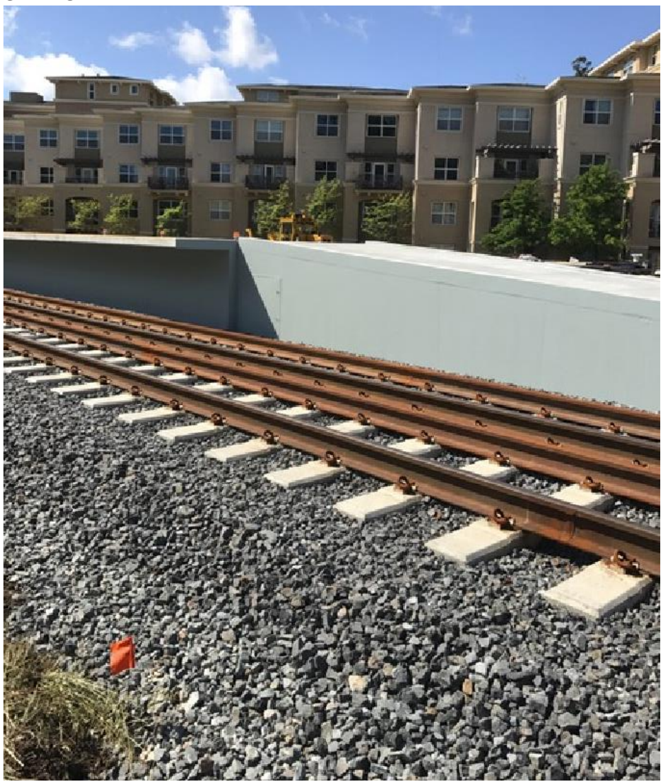
The sides of the platforms have been painted to match all other stations.