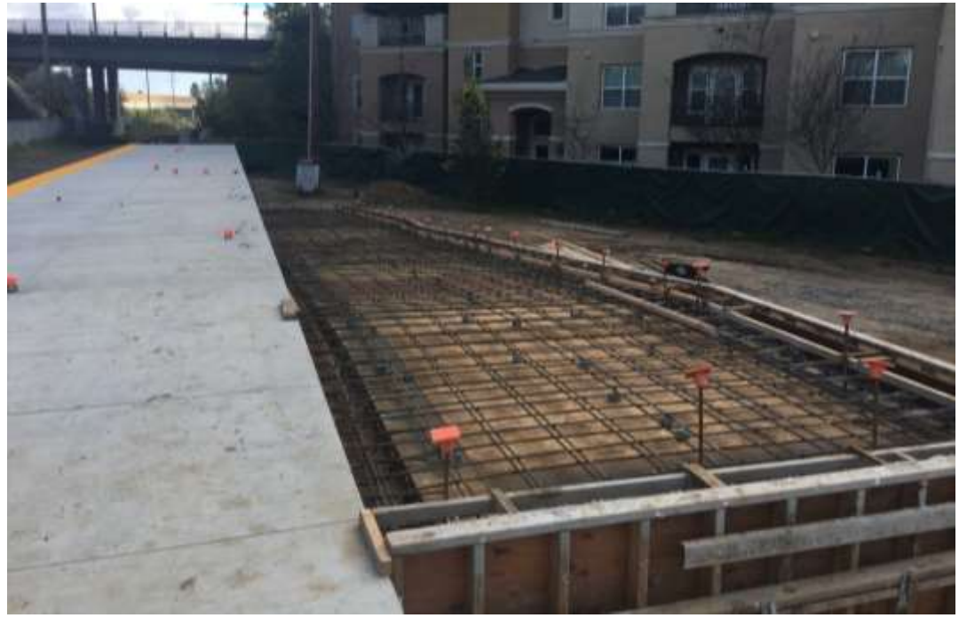
Ramp rebar finished and ready for deck pour at south of station.