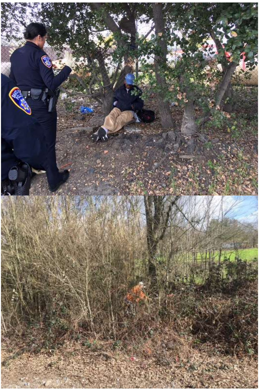
Individuals try very hard to conceal themselves along the right of way.

Code Compliance continues to inspect the right of way on a daily basis. They check for any camps, trespassers, cuts to the fence or damage to the right of way. In some circumstances when a trespasser refuses to leave when asked, the local police agency assists.