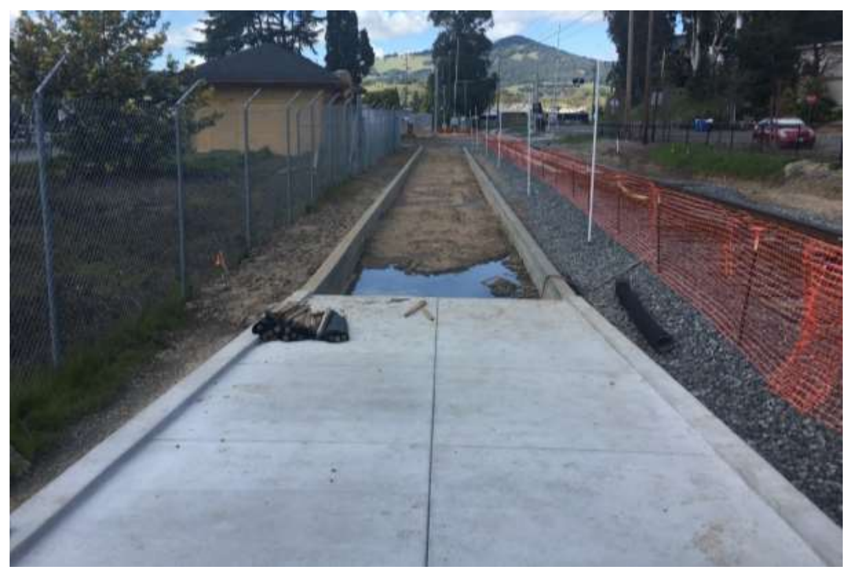
Curb from north ramp to Grant Street.