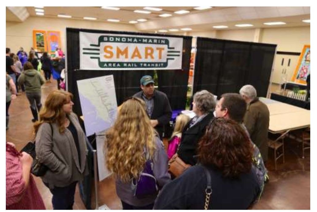
SMART's outreach crew connects with the public at the Cloverdale Citrus Fair

Presentations can be arranged by contacting SMART's communications team via email at <u>info@sonomamarintrain.org</u> or by calling the SMART outreach hotline at (707) 794-3077.