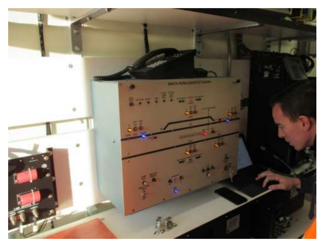
Signal Engineer verifying vital processor setup during testing, Santa Rosa

Checking results during Positive Train Control Testing, onboard at Cotati Station