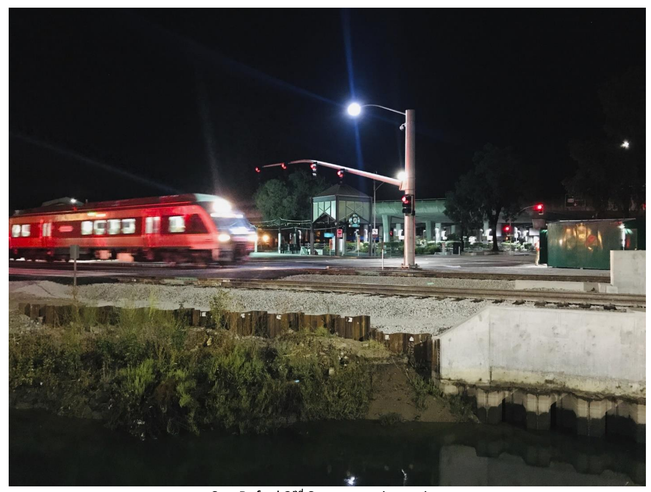
San Rafael 2<sup>nd</sup> Street – train testing