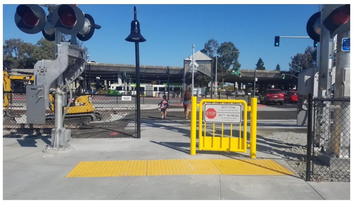
Bettini Transit Center – Pedestrian Safety channelization along 2<sup>nd</sup> Street