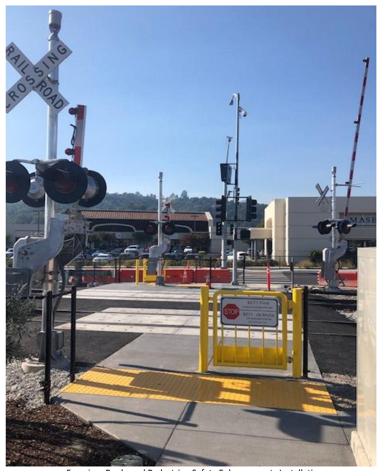
Francisco Boulevard Pedestrian Safety Enhancements Installation