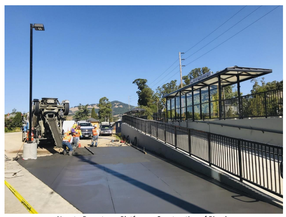
Novato Downtown Platform – Construction of Bicycle