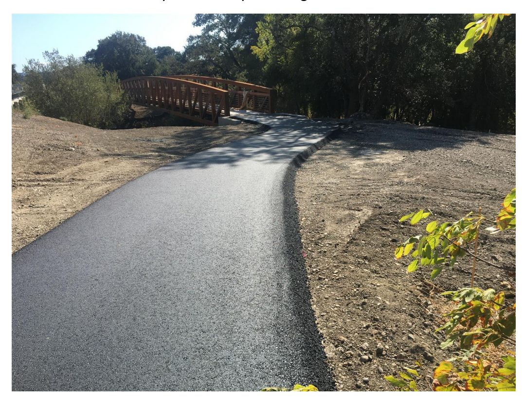
Paving North of the Petaluma River