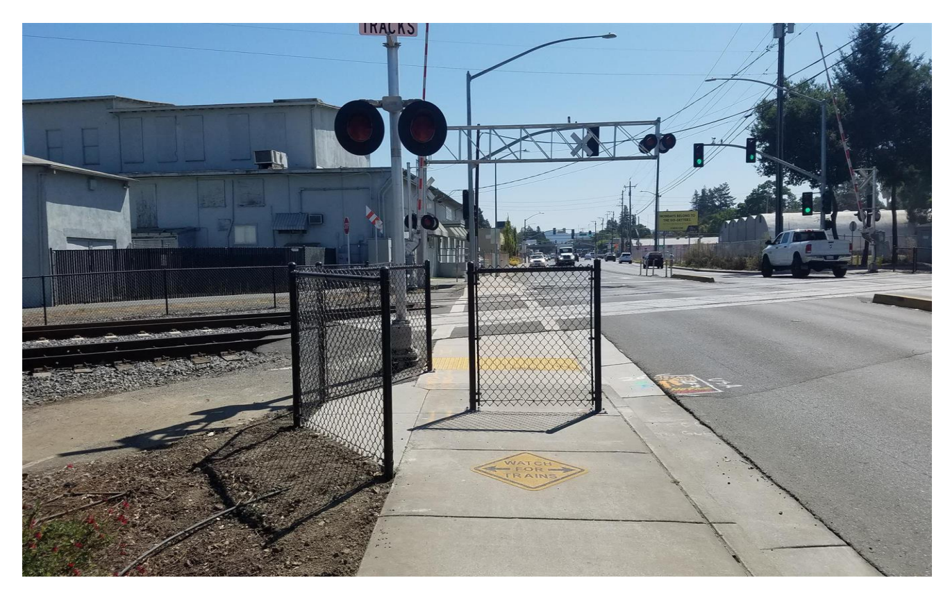
College Ave, Santa Rosa-Pedestrian Channelizing Fence