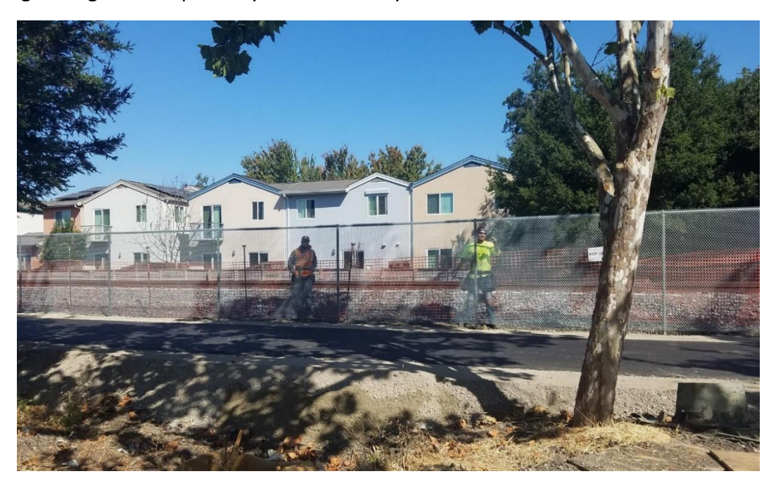
Payran Pathway - Fencing Installation