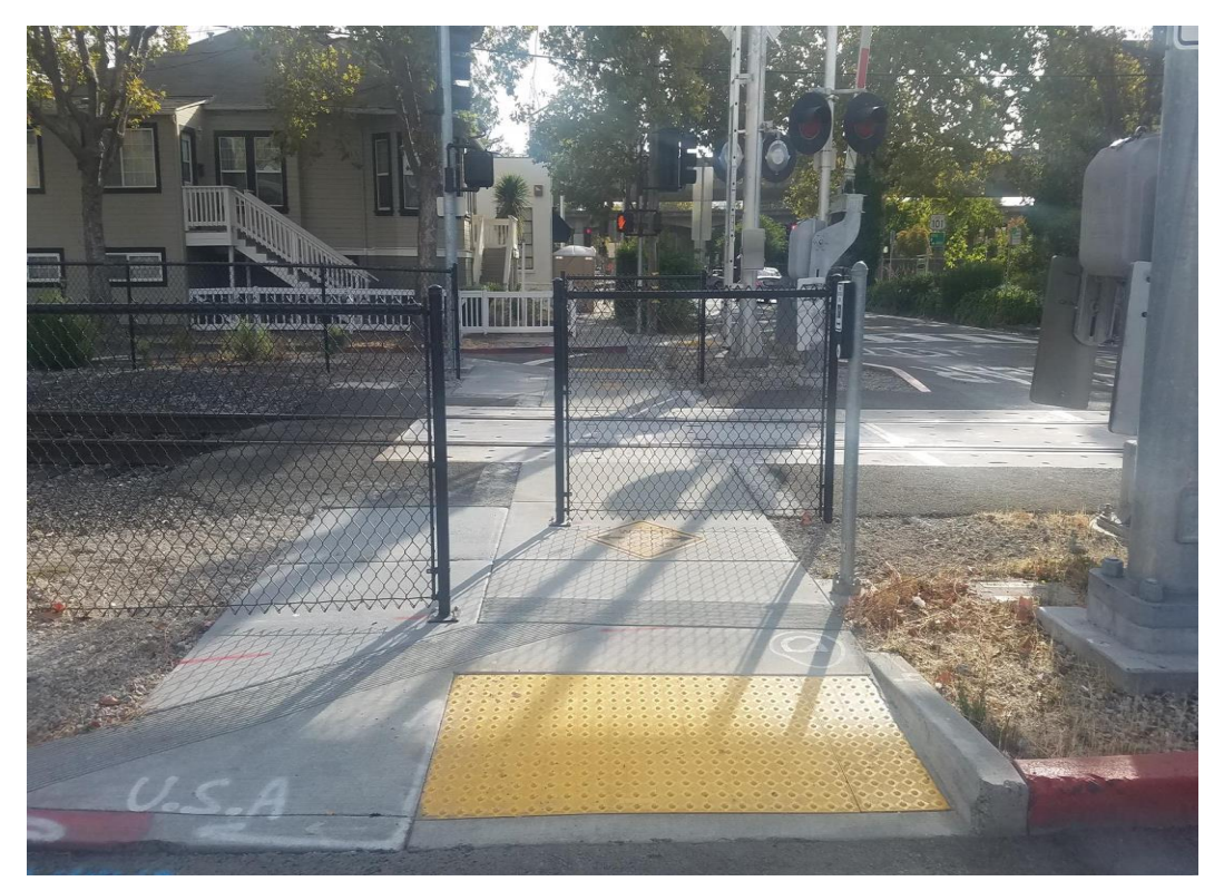
5^{\text{th}} Street, San Rafael - Pedestrian Channelizing Fence