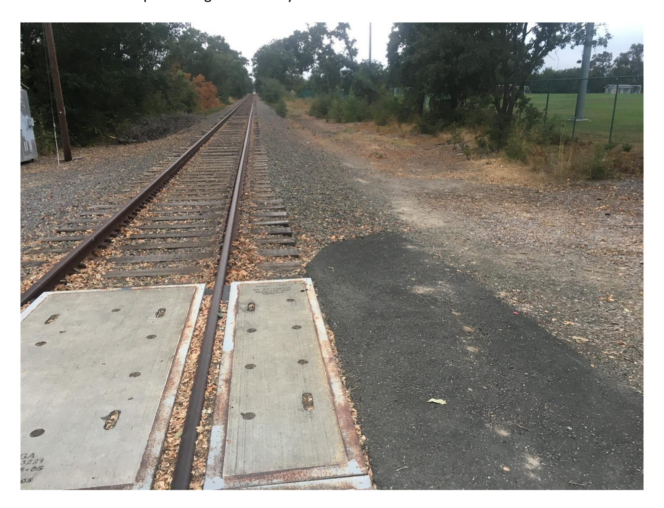
Windsor Extension - Looking North at Michelle Lane