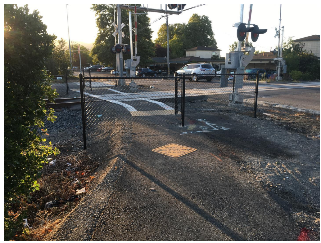
Bellevue Ave, Santa Rosa - Pedestrian Channelizing Fence