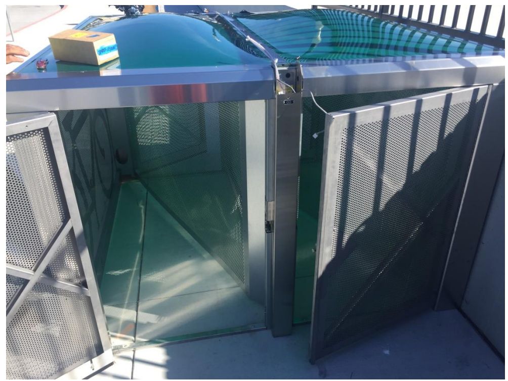
View looking inside the bike locker installed at the Cotati Station