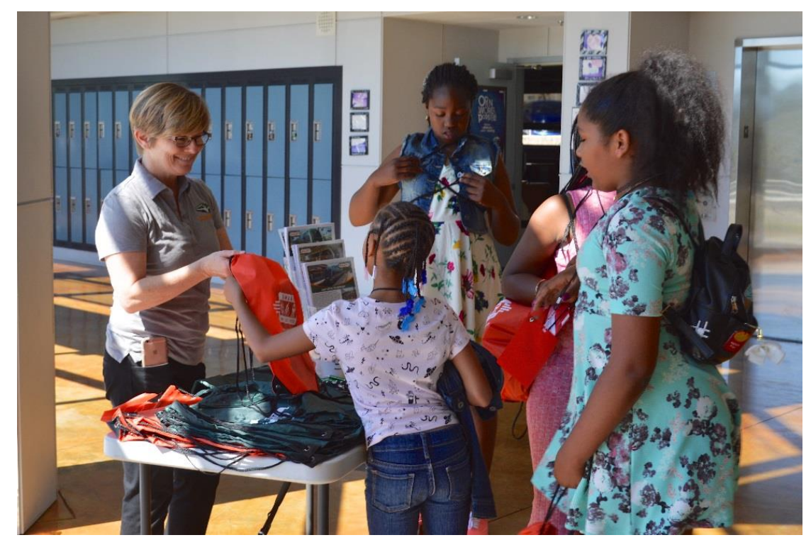
SMART staff presents information to students at Performing Stars Enlighten program in Marin City