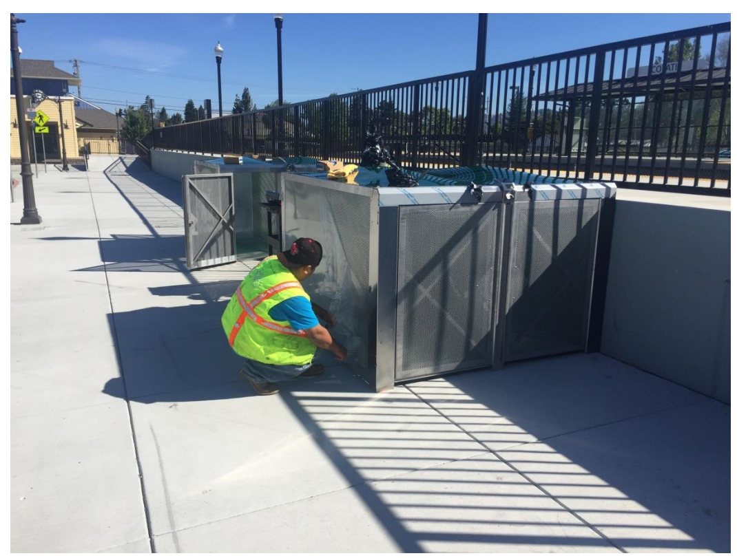
A worker from Bike Link, the locker manufacturer, installs the electric bike locker at the Cotati Station