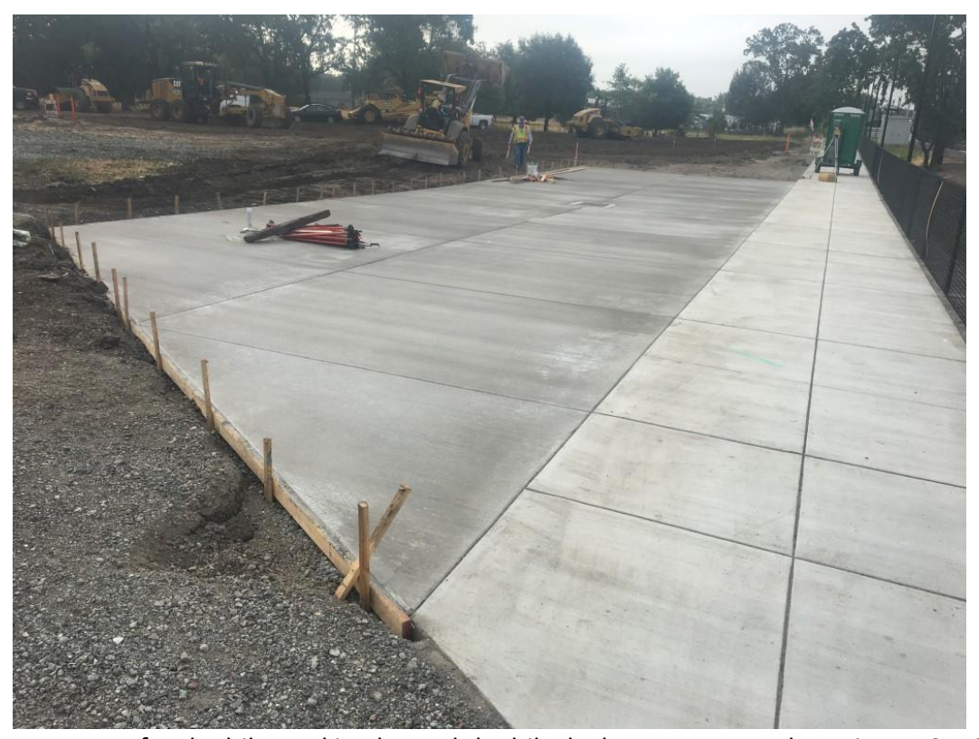
Concrete area for the bike parking lot and the bike lockers was poured at Airport Station