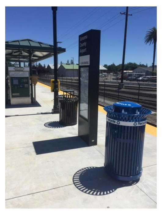
Signage, Recycle Trash Can, and Clipper Card Machine is installed and ready for Opening Day