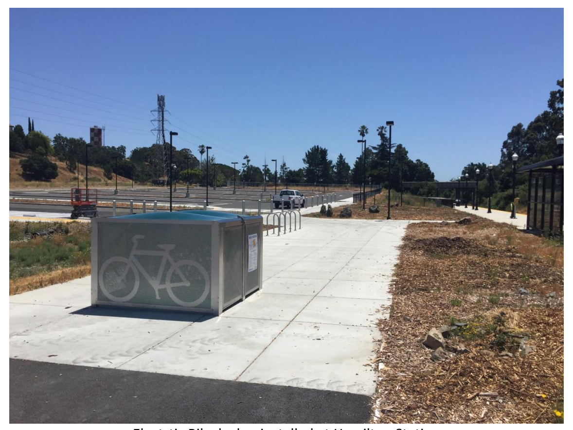
Electrtic Bike locker installed at Hamilton Station