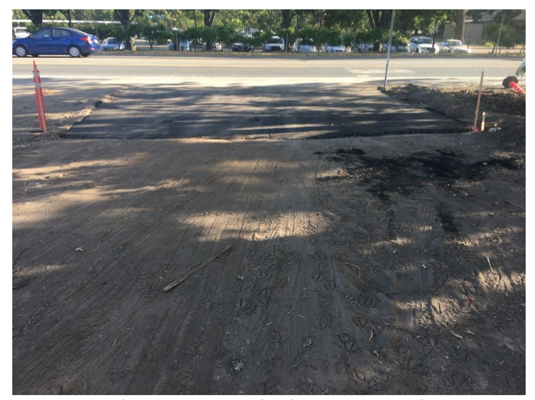
The Airport Station parking lot entrance is paved