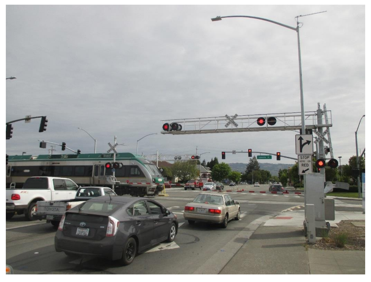
SMART Train Performing Station Stop Tests at Petaluma Station