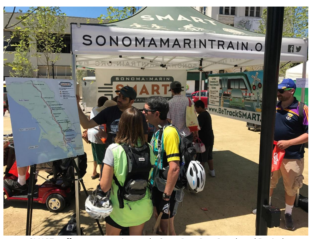
SMART staff answers questions at the Santa Rosa Rose Parade and Festival