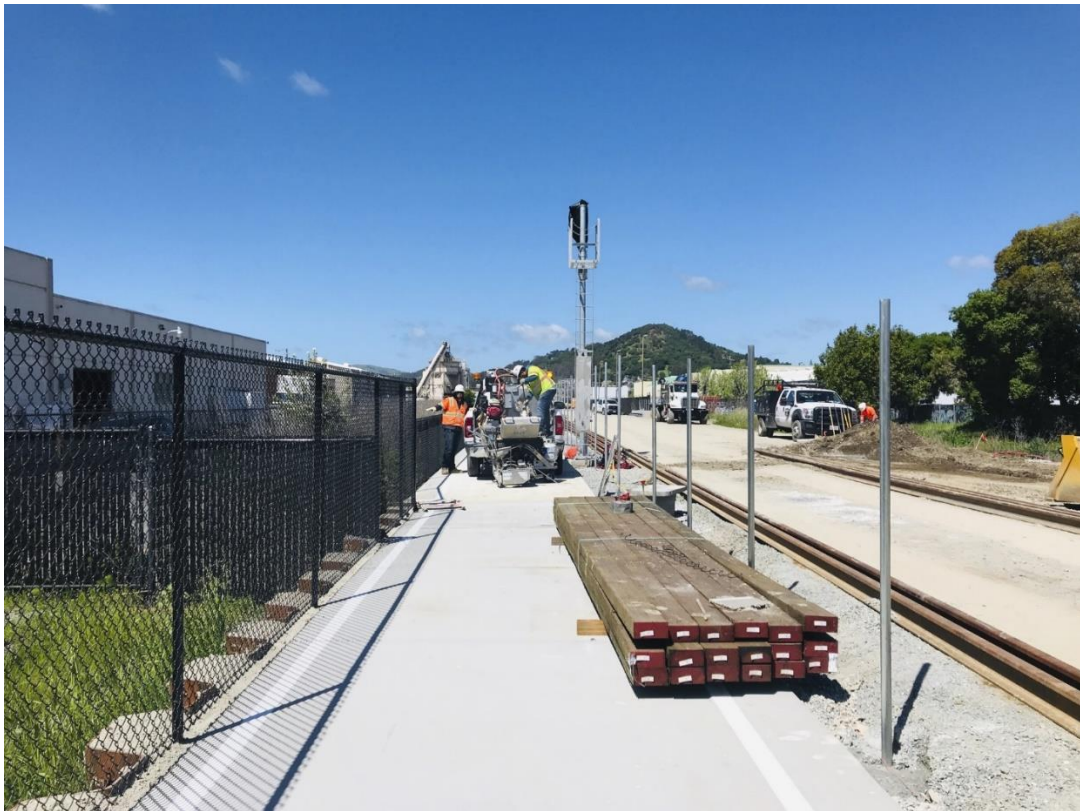
Multi Use Pathway-Pathway construction near Andersen Drive