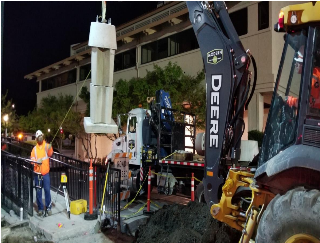
Installation of traffic signal foundation at 3 rd Street.