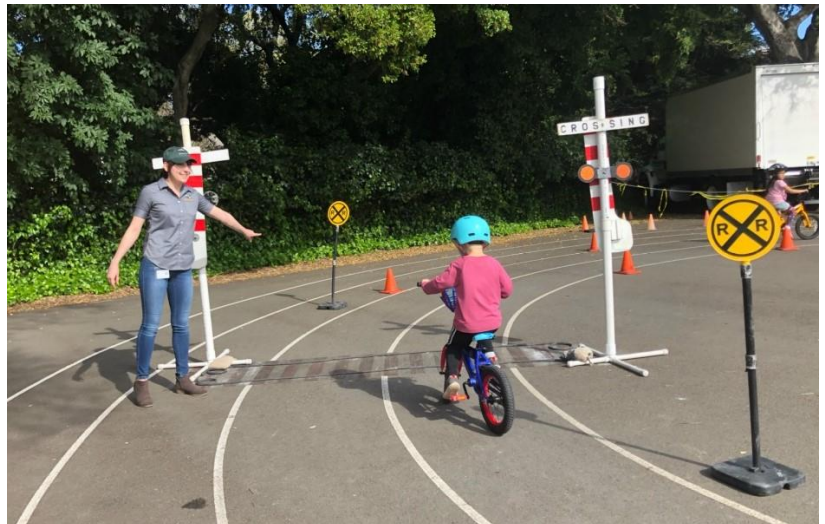
Students at McNear Elementary in Petaluma learn railroad crossing safety as part of SMART's safety outreach program.

Each member of SMART's Communications and Marketing staff is an authorized volunteer for Operation Lifesaver, the leading national rail safety education and awareness organization. In spring, Operation Lifesaver partners with Sonoma County Safe Routes to Schools and local law enforcement to host bike rodeo safety training at local elementary schools. Children are taught basic bicycle safety, which includes railroad crossing safety. SMART volunteers operate the mock gate arms on the safety course and teach students how to safely cross the railroad tracks at designated crossings.