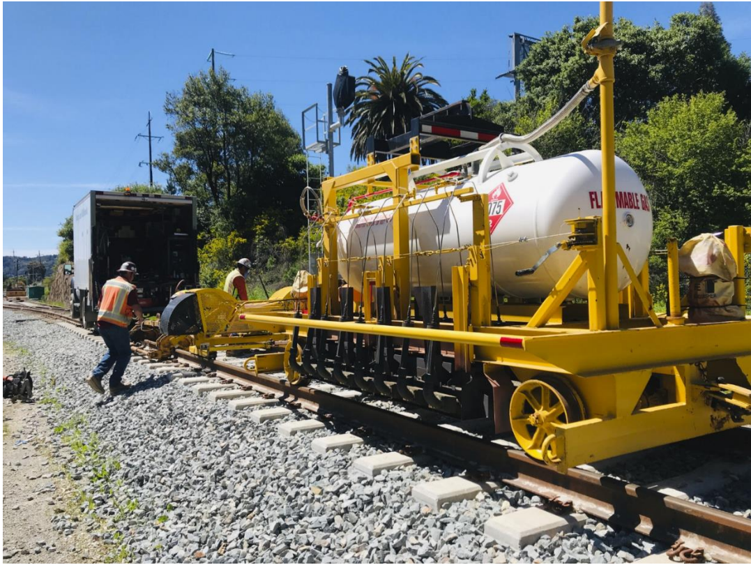
Track construction between Larkspur Platform and Cal Park Tunnel