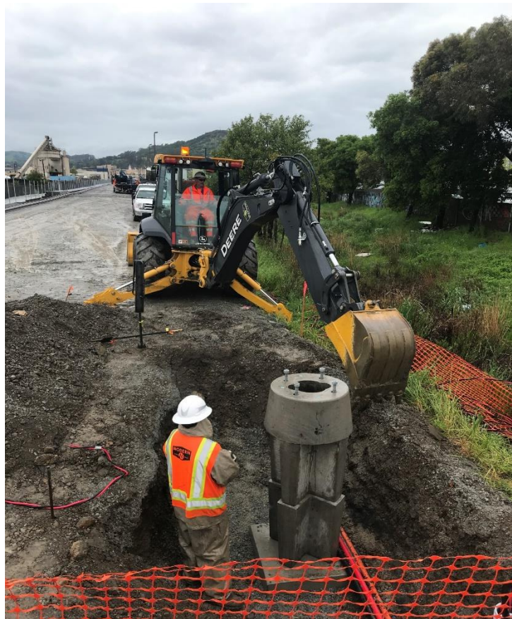
Signal foundation installation at near Rice Drive