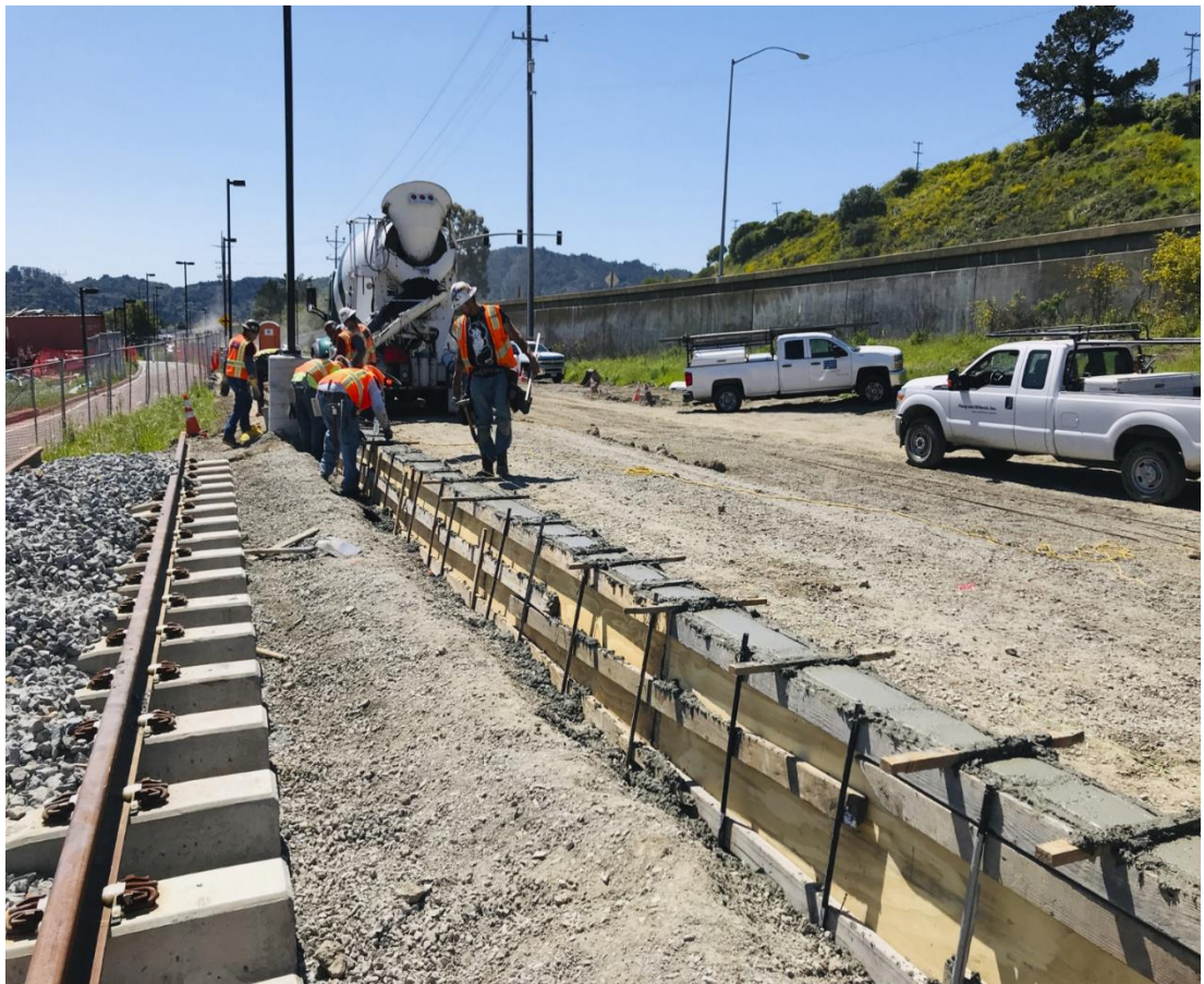
Larkspur Station- Sidewalk Construction at the Parking lot