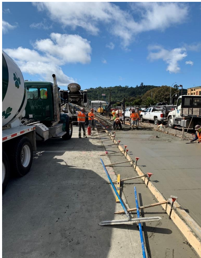
Bettini Transit Center – reconstructing Platform C