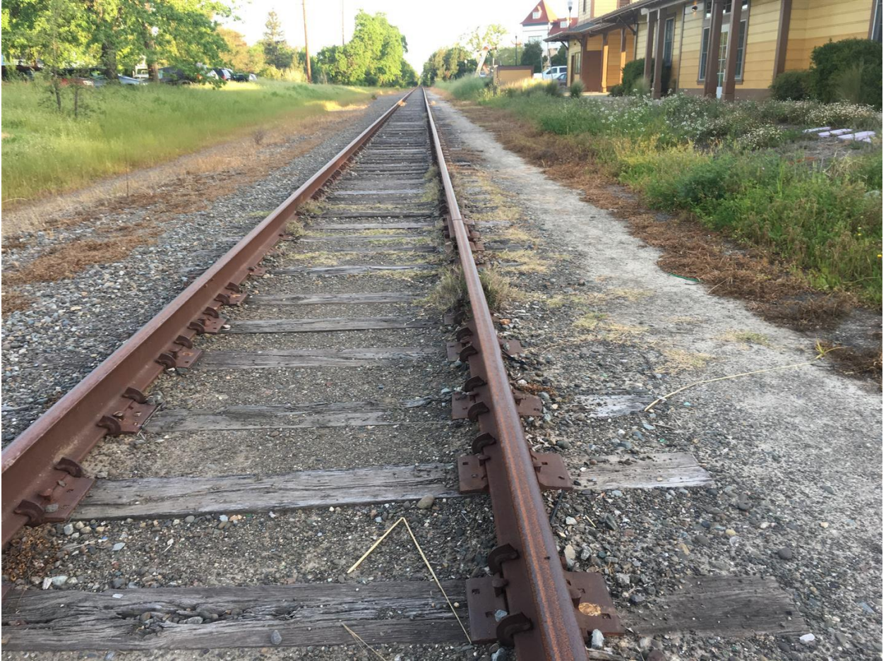
Future Windsor Station platform location