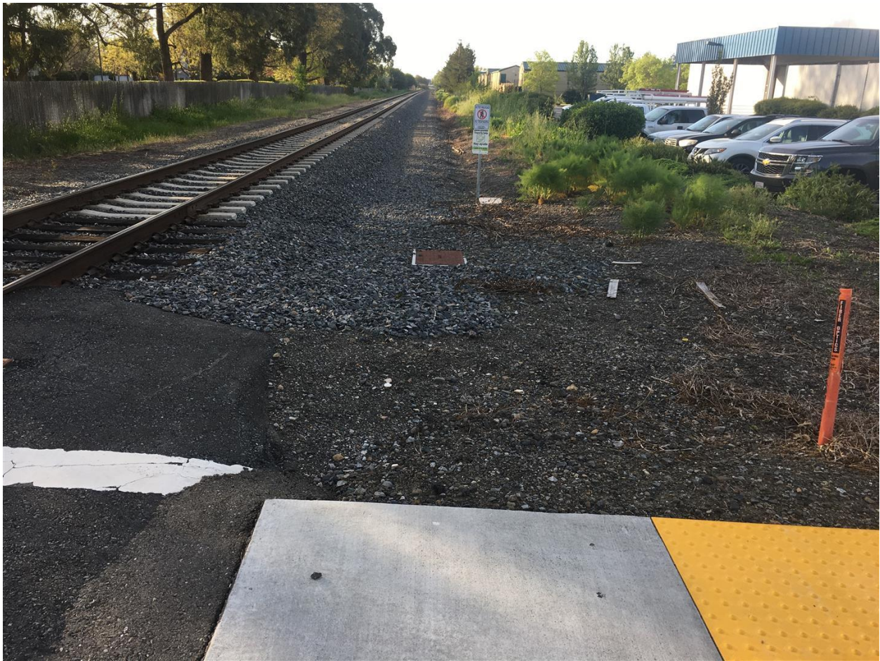
Looking south from Southpoint Boulevard along the pathway route