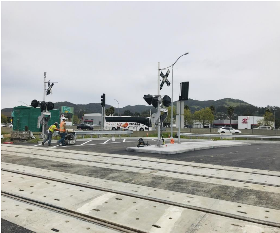
Striping at Francisco Boulevard West to Rice Drive